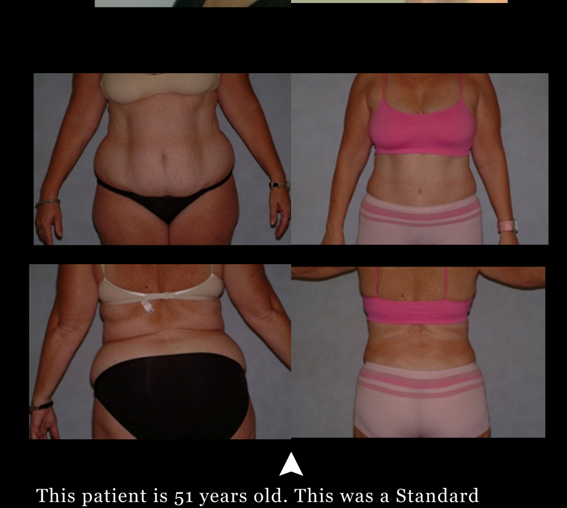
After photos for this patient were taken one years postoperatively.

liposuction procedure with 4500 cc's of fat resected.